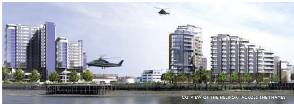
CGI VIEW OF THE HELIPORT ACROSS THE THAMES