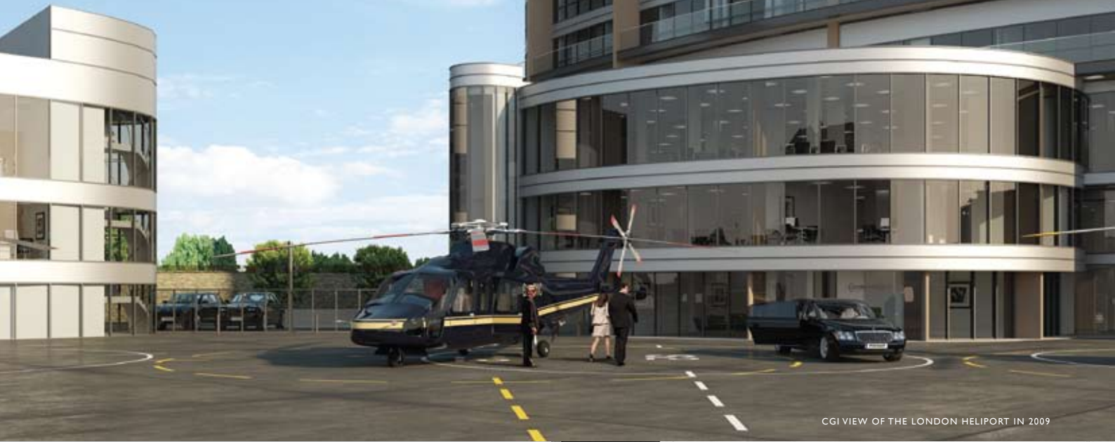
CGI VIEW OF THE LONDON HELIPORT IN 2009