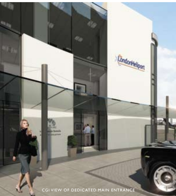
CGI VIEW OF DEDICATED MAIN ENTRANCE