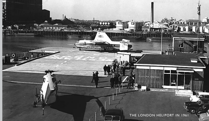
THE LONDON HELIPORT IN 1961