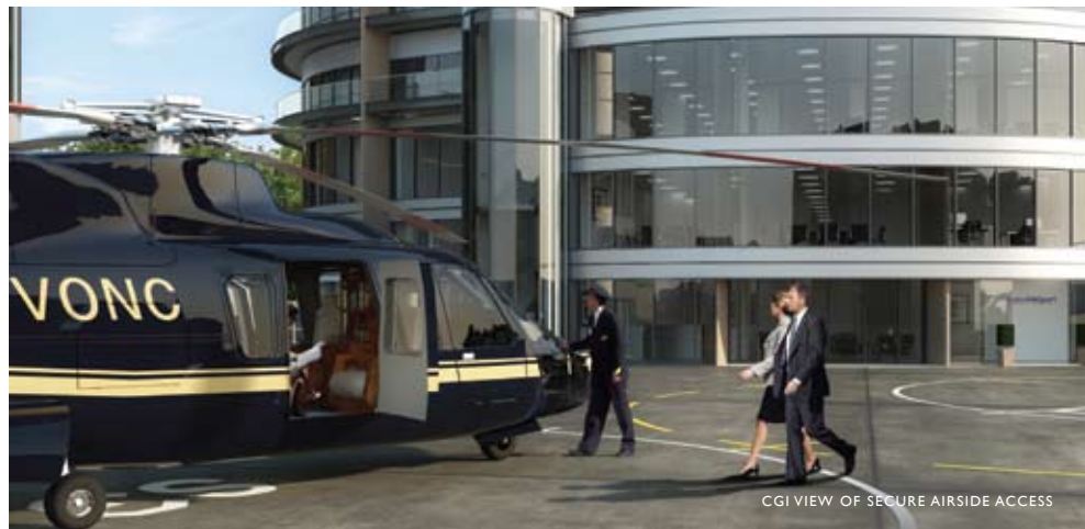
CGI VIEW OF SECURE AIRSIDE ACCESS

The official inauguration of the new hotel and Heliport development is planned for Summer 2009, coinciding with The Heliport's 50th anniversary, and is currently on schedule to meet this target date.