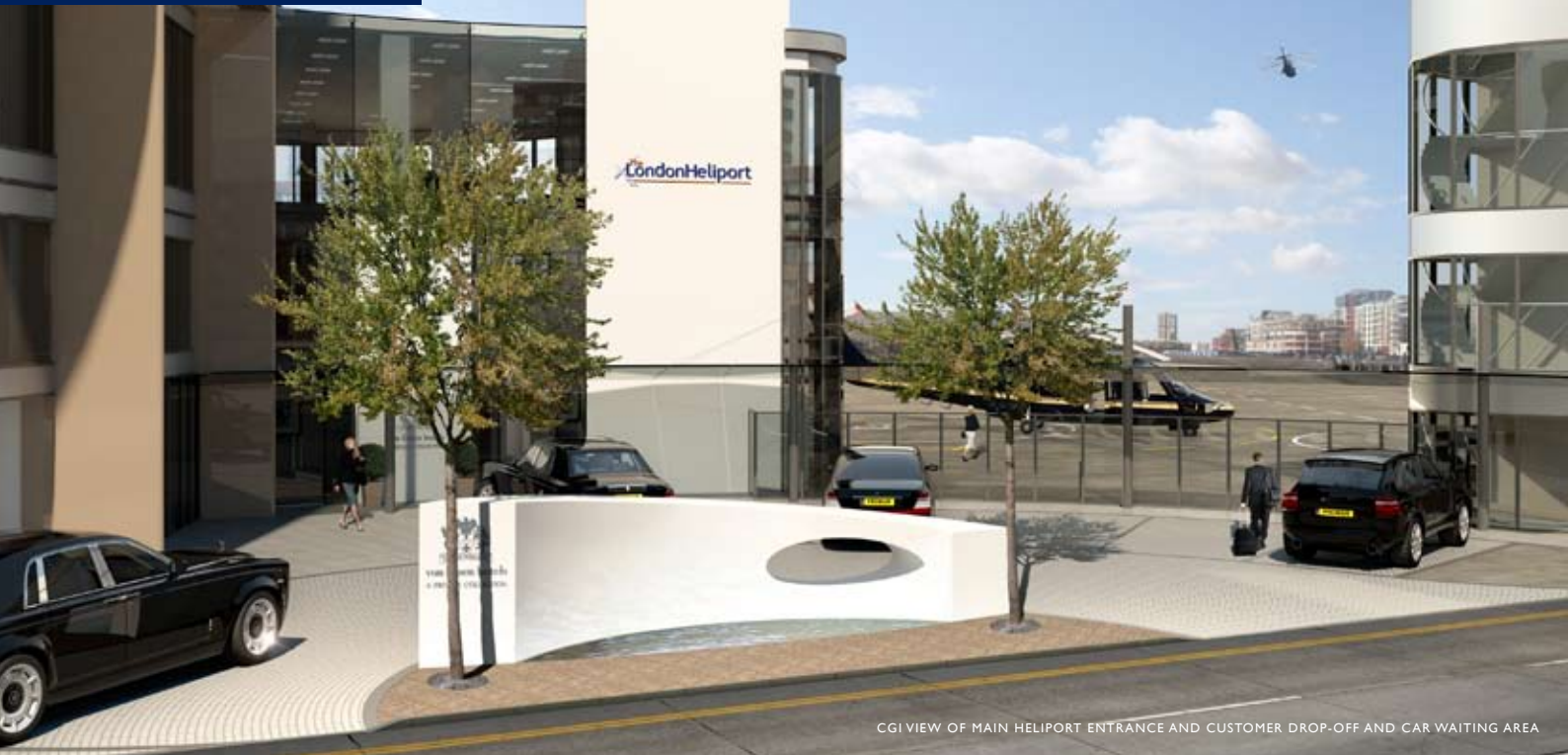
CGI VIEW OF MAIN HELIPORT ENTRANCE AND CUSTOMER DROP-OFF AND CAR WAITING AREA

von Essen group announced plans in February 2007 to open a brand new secure executive aviation terminal for London's vertical gateway at The London Heliport.